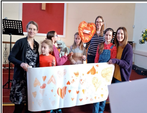
Supporting the Refugee and Asylum Seekers project as shared at last Sundays service.

Supermarkets are NOT stocking the Real Easter Egg this year and the folk who produce them are asking that Christians who want to promote the real meaning of Easter, should support this very worthwhile project! Each Easter Egg, and there are numerous choices available, contain the Easter story ranging from simple guides to 24 page activity books and gives opportunity to share the joy of Easter with friends and family. Look for 'The WBC Champion' in future Newssheets who will co-ordinate orders from our fellowship!